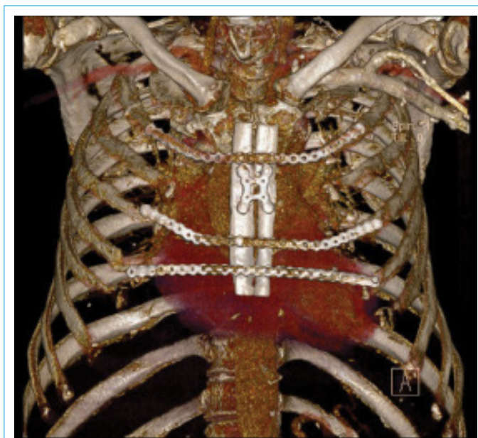
Figure 4. Postoperative thorax CT appearance.

to move and felt the need for defecation. On the third day after the withdrawal of the drainage tube in the mediastinum due to lack of drainage on postoperative fifth day, a lung radiography was taken to control the condition, and the graphy revealed a staging in the mediastinum. Upon the aspiration of seropurulent fluid after puncture biopsy, a drainage tube was placed in the mediastinum again, and mediastinal irrigation of 4x1 per day was commenced. For irrigation, the solutions with povidone iodine and rifampicin were used. The seropurulent fluid in the case was mediastinally irrigated for one week and observed to become serous. When major depressive symptoms were witnessed in the case on postoperative 15 th day, the case was discharged with the mediastinal drainage tube. Following the withdrawal of the drainage tube on 35 th day after the discharge, our case still maintains a healthy life for four months (Fig. 4).