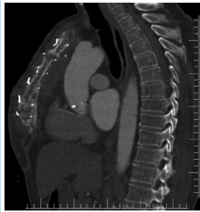
Figure 1. Computed tomography appearance of preoperative sternum.

was hospitalized by planning the sternum resection and the reconstruction of anterior thorax wall. According to the results of antibiogram isolate ( klebsiella pneumoniae ) obtained from the injury discharge, the treatment regime (vankomycin and meropenem) was commenced.