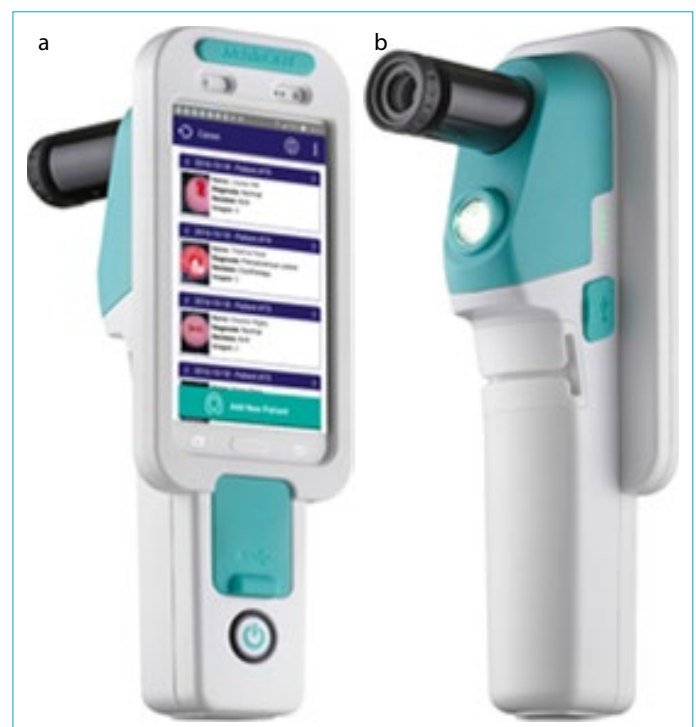
Figure 1. EVA™ system. (a) Front view of EVA™ system and CervDx application. (b) Back view of EVA™ system.

The purpose of this study was to screen and treat women in remote communities on the periphery of Iquitos, Peru in the Amazon basin for cervical dysplasia and cancer. Screening was performed in October 2017 using a digital handheld colposcope (EVA™ system, MobileODT, Israel). Amazon Promise, a local NGO that partners with governmental health clinics, identified communities that had