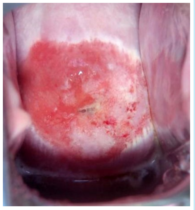
Figure 3. Digital cervicograph showing CIN3.

Treatment for those with suspected low-grade dysplasia consisted of cryotherapy. Cryotherapy was performed us-