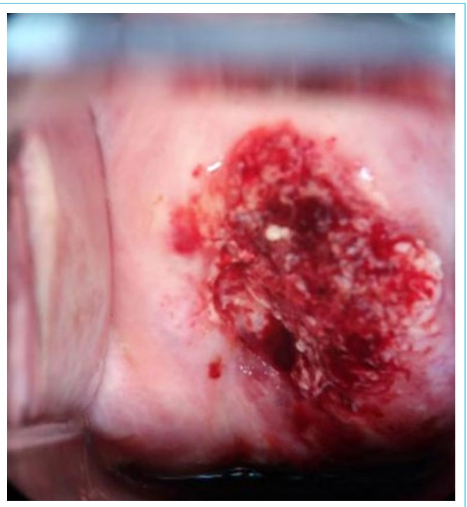
Figure 4. Digital cervicograph showing cervical cancer.